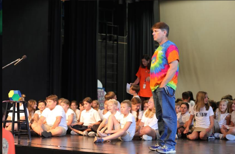
House induction/sorting ceremony