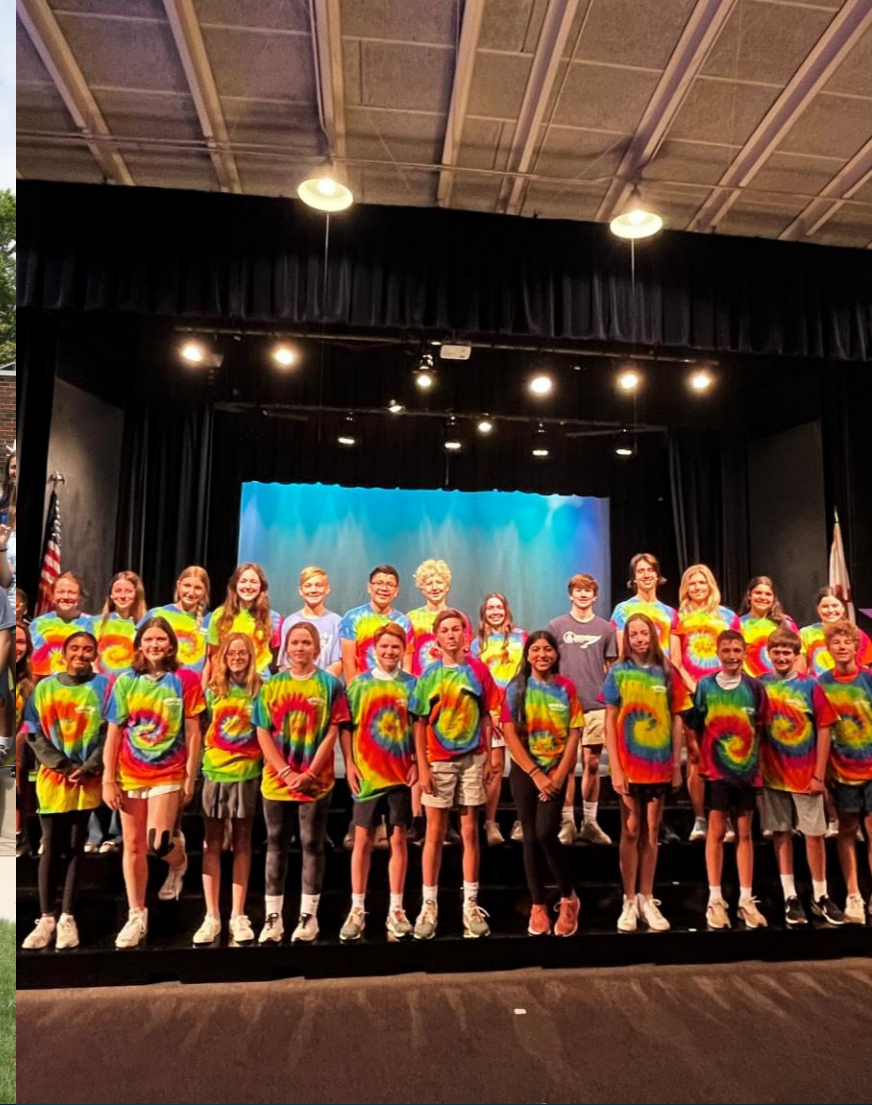
House Cup Ceremony/Leadership Transition